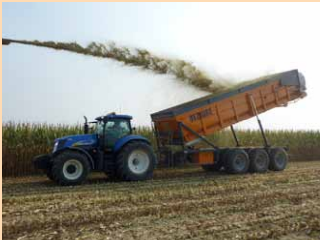
The overload trailer as silage trailer