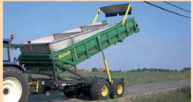
Special model for peas