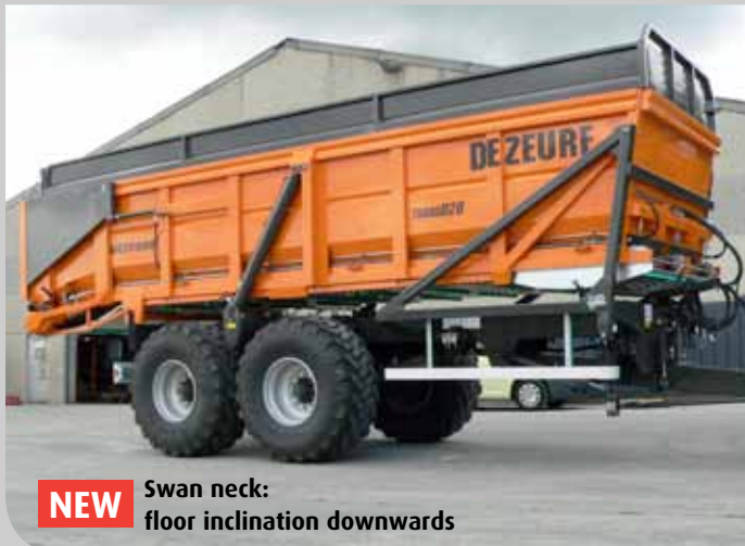
NEW Swan neck: floor inclination downwards