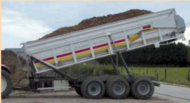
Special model for grains